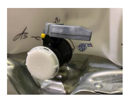
Multi-use valve with screw on male-camlock