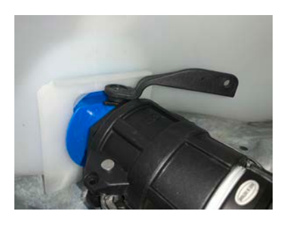
Turn clockwise to open.

Attach the Valve Lever in position so the valve can be opened.