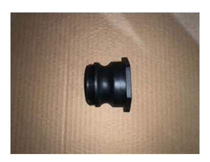
Kit | Camlock straight extender